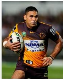
Justin Hodges (Brisbane Broncos, Australian & QLD Rugby League Legend)