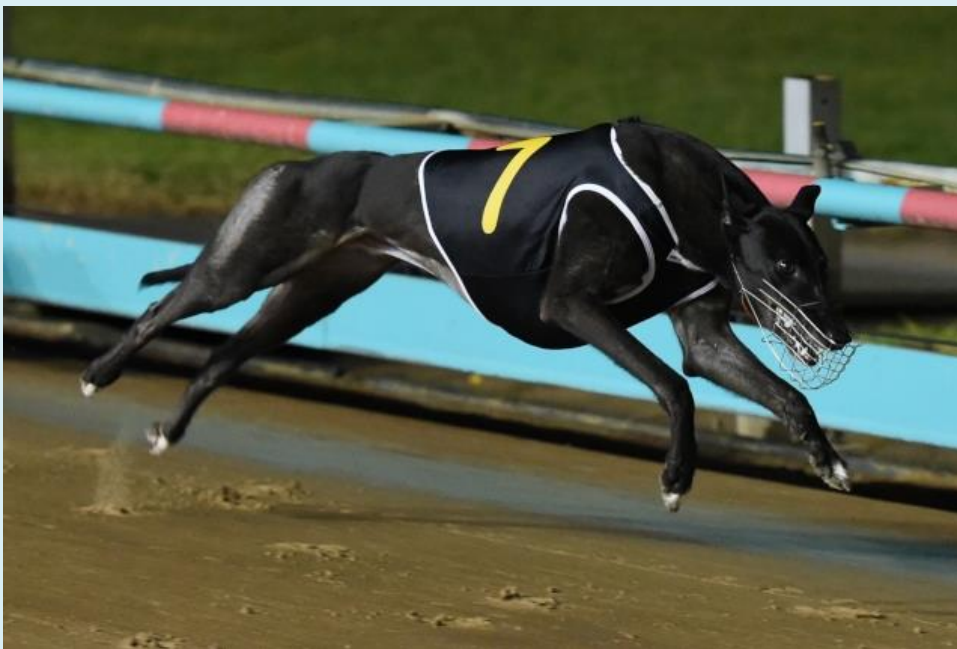
Last year's Brisbane Cup winner Dyna Double One

The Brisbane Cup has had a few name changes when it was first run in 1972 and won by Victorian Garron Court the race was known as the Gabba Sprint Championship. It remain that name until 1976. It was then called the Brisbane Cup from 1977 until 1981 changed in 1982 to be known as the Coca-Cola Cup until 1999 when it changed back to the Brisbane Cup. The race was conducted at the Gabba until the track closed in 1992 and since has been staged at Albion Park. Listed below is the Honour Roll containing some of the champion greyhounds among the past winners.